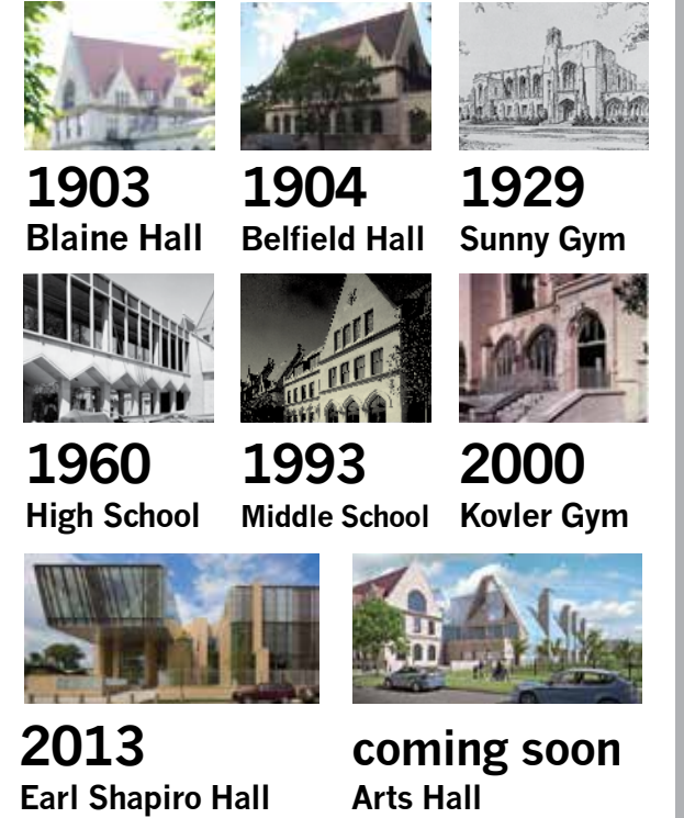
BUILDINGS AND THE YEARS THEY WERE BUILT

8 new/remodeled High School science labs